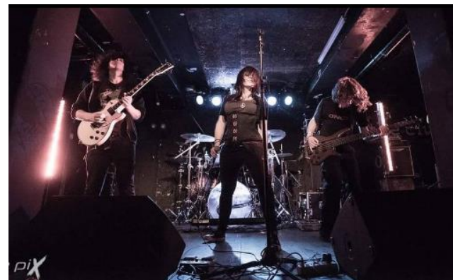
Ticket to Nowhere live on stage